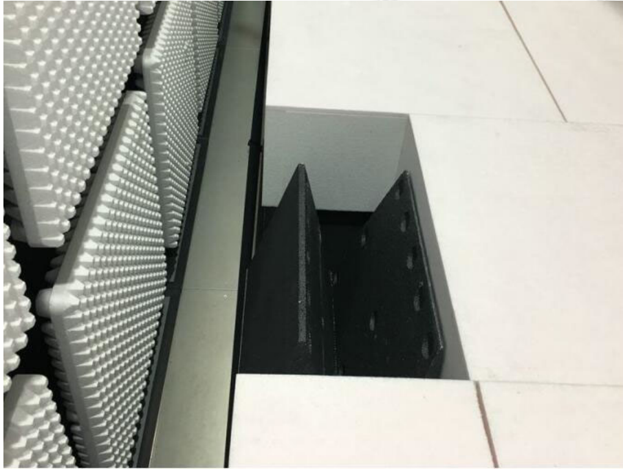
Radiated spurious emission Test Setup-3(Above 1GHz) There are absorbing materials under the ground.