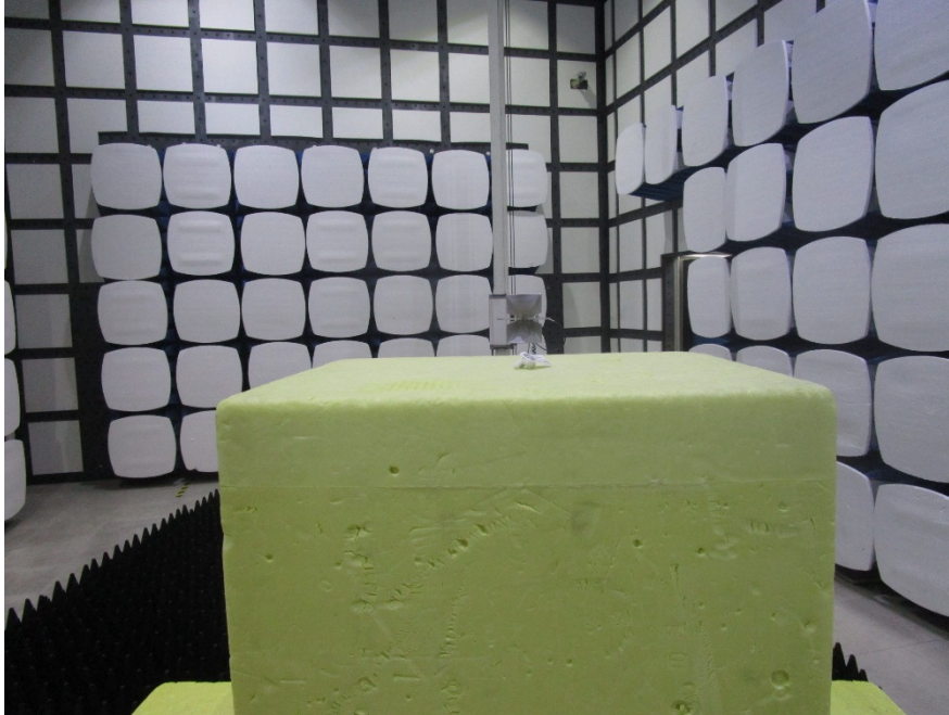
Radiated Emissions which fall in the restricted bands