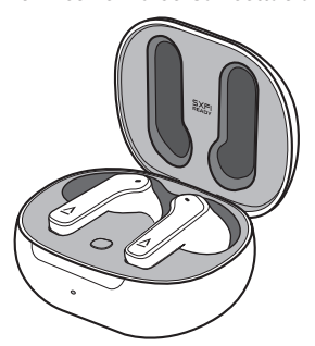
Quick Start Guide 使用产品前请阅读使用说明 Model No. / 型號 / 型号: EF1050

Lightweight True Wireless Sweatproof In-ears With Active Noise Cancellation