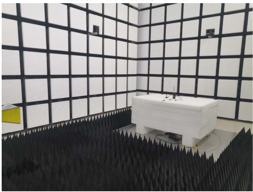
Radiated Emissions Above 1G View-TM4