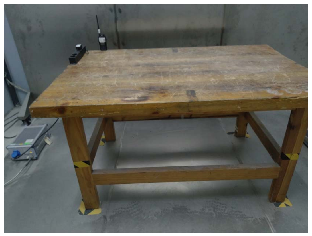
Conducted Emissions Side View-TM1