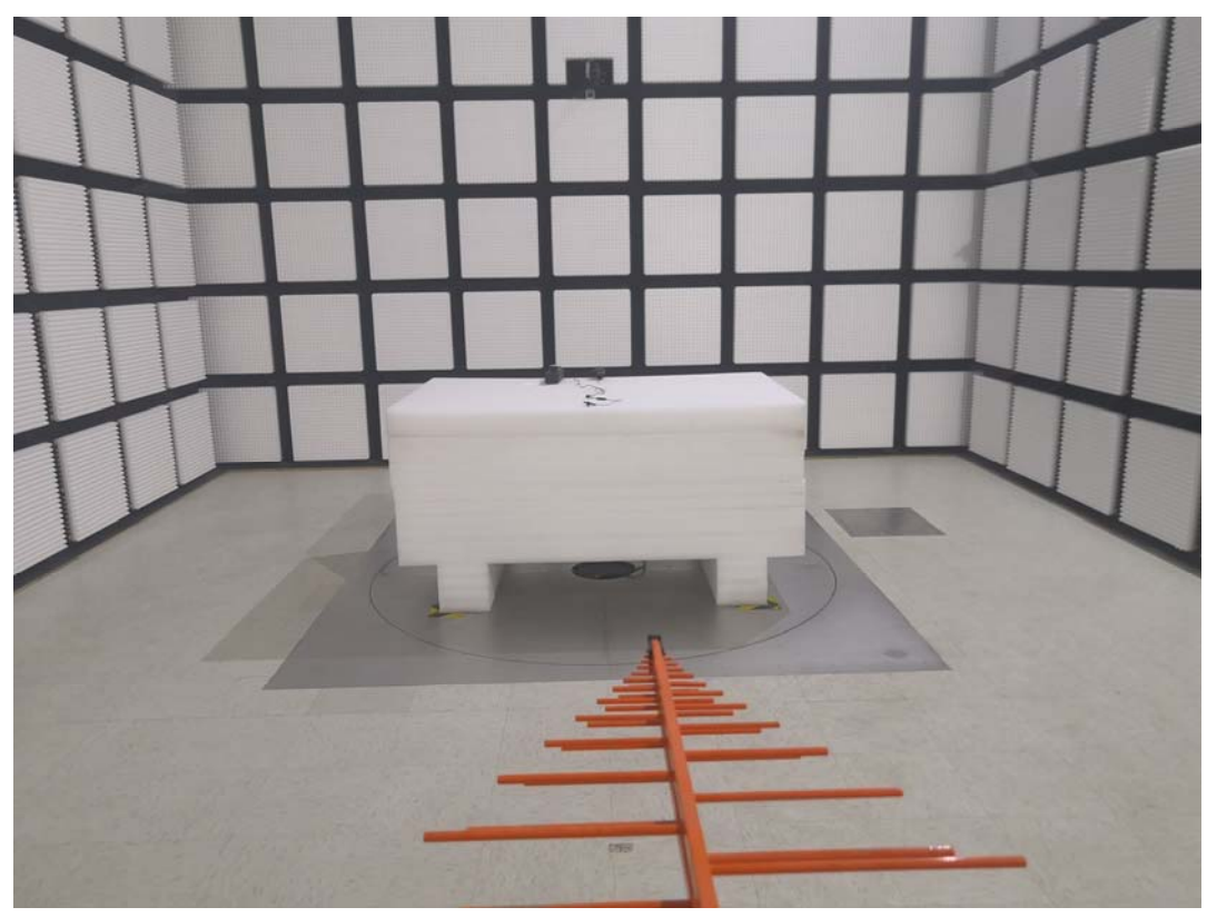
Radiated Emissions Below 1G Rear View-TM1