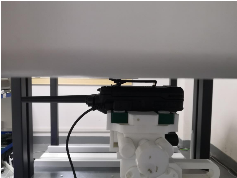
The thickness of EUT is 3.5 cm