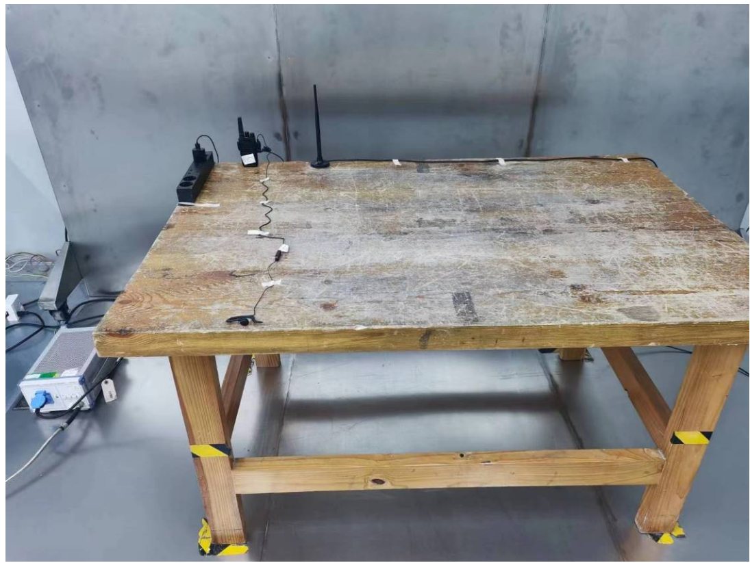
Conducted Emissions Side View