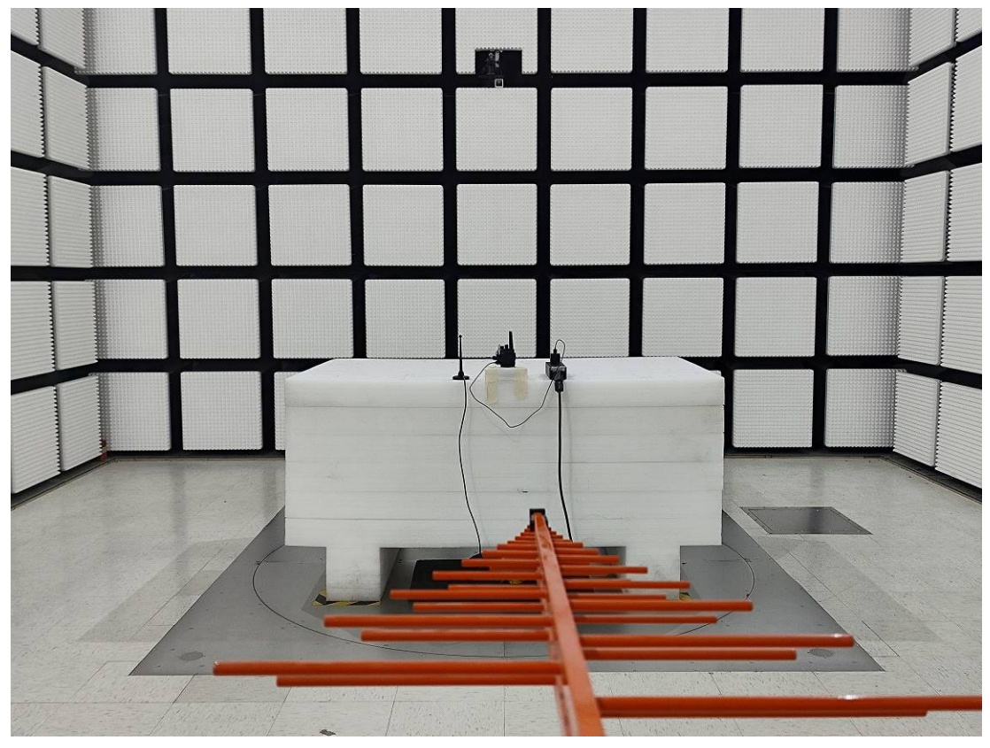
Radiated Emission Below 1GHz Rear View