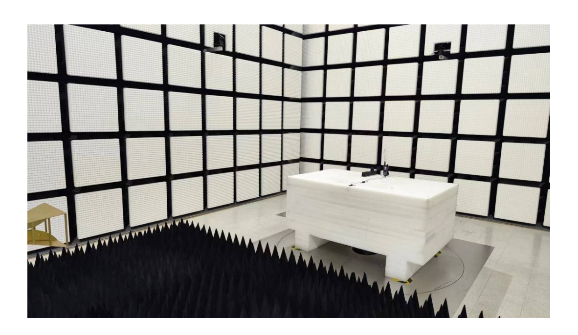
Radiated Emission Above 1GHz Rear View M1