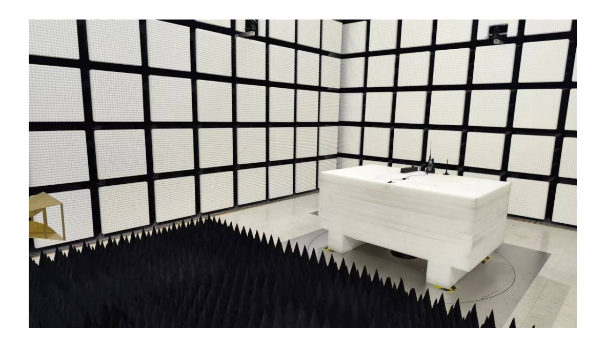
Radiated Emission Above 1GHz Rear View M2