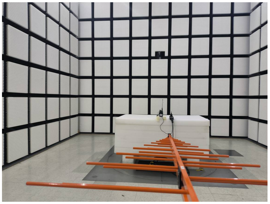
Page 3 of 6