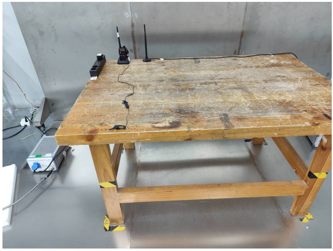
Conducted Emissions Front View M2