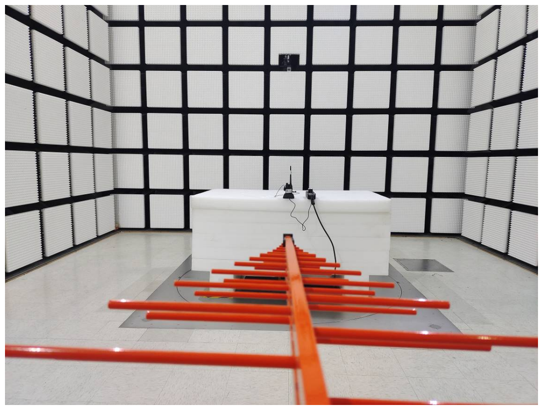
Page 3 of 6

Radiated Emission Below 1GHz Rear View M1