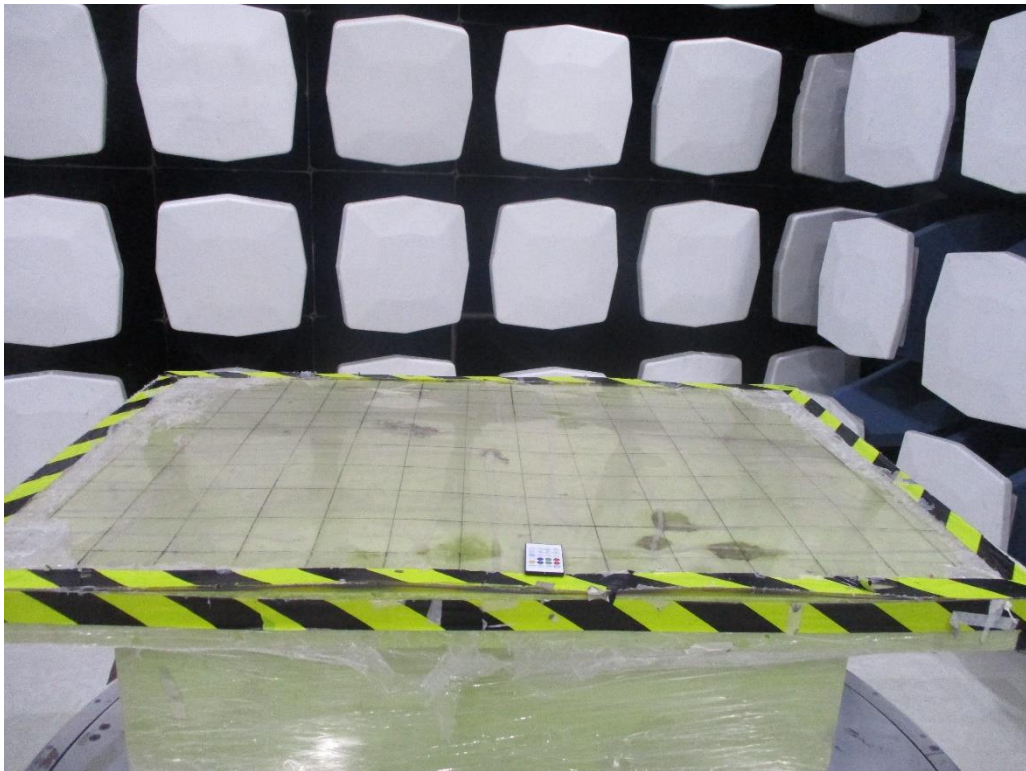
Below 1GHz (The EuT placed at the center of turntable)