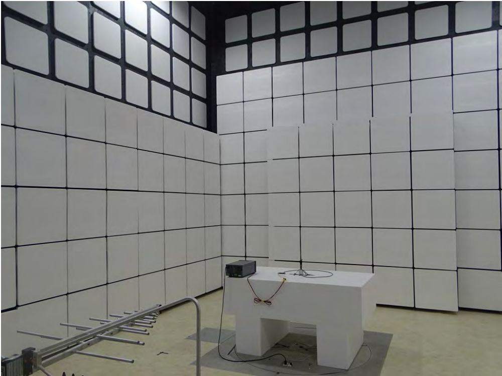
Radiated Test (Horn) - whip Antenna