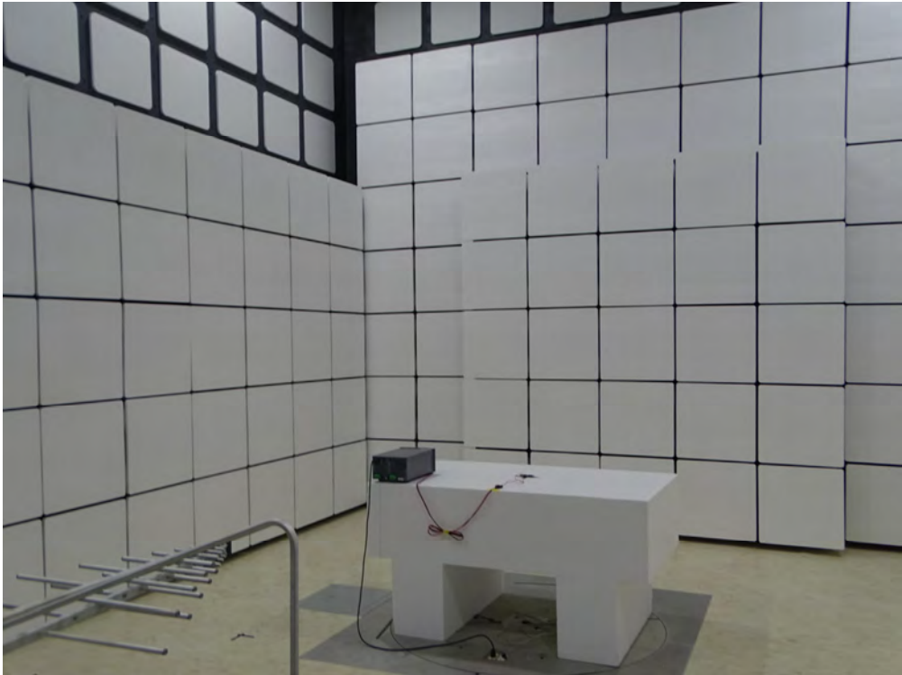
Radiated Test (Horn) - PCB Antenna