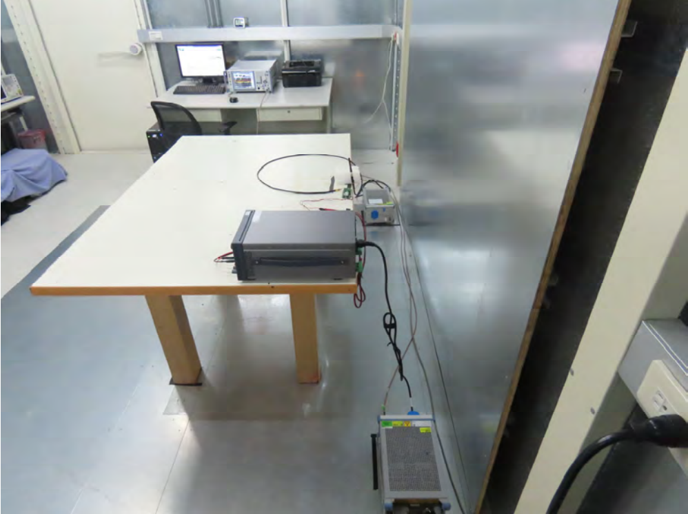
Back View of Conducted Test - whip Antenna