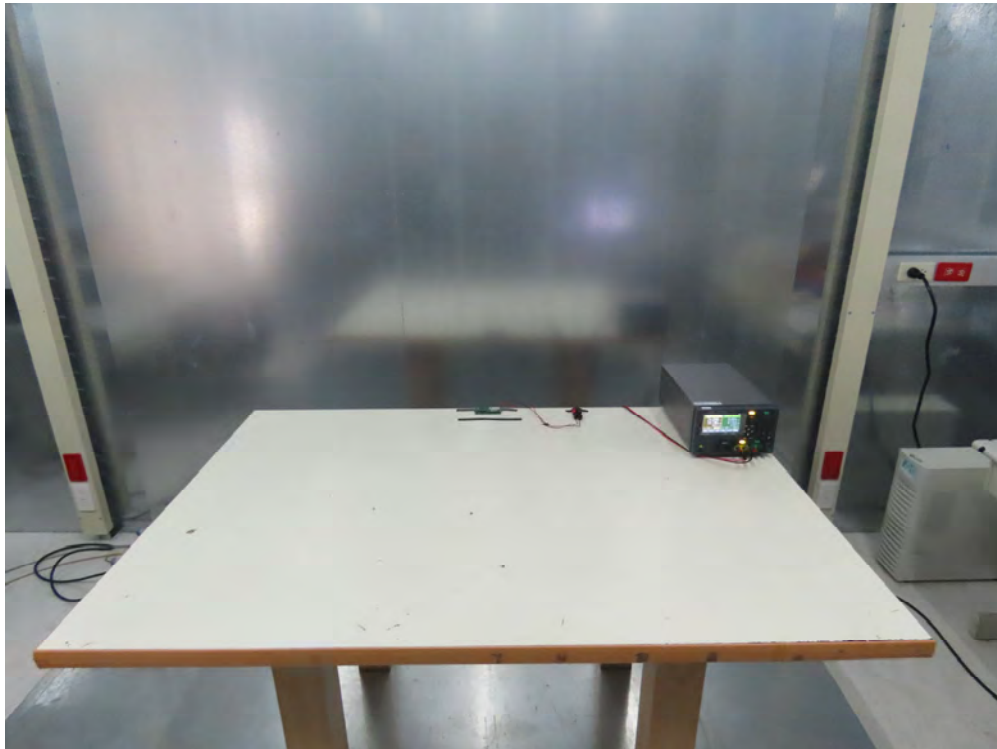
Back View of Conducted Test - PCB Antenna