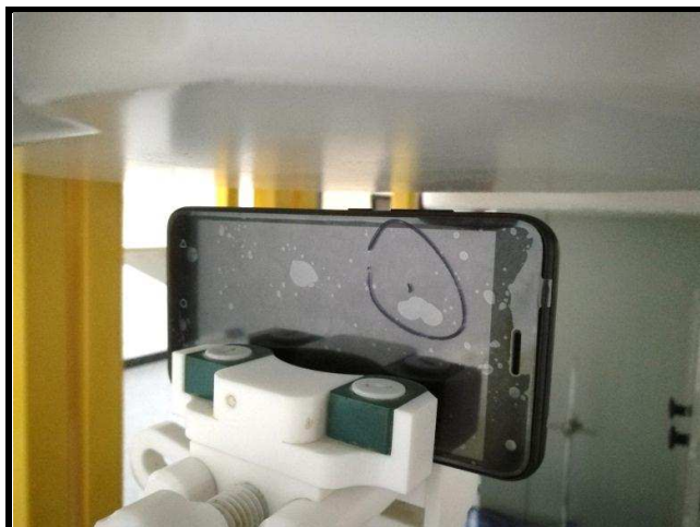
Left Side of EUT with 1.0 cm Gap