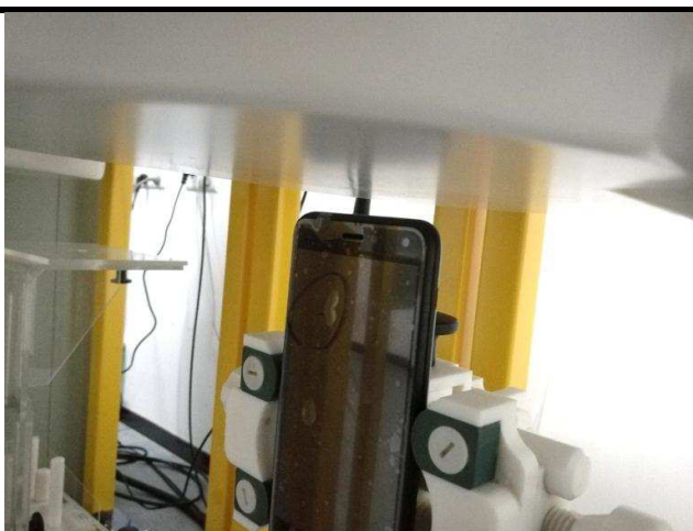
Top Side of EUT with 1.0 cm Gap