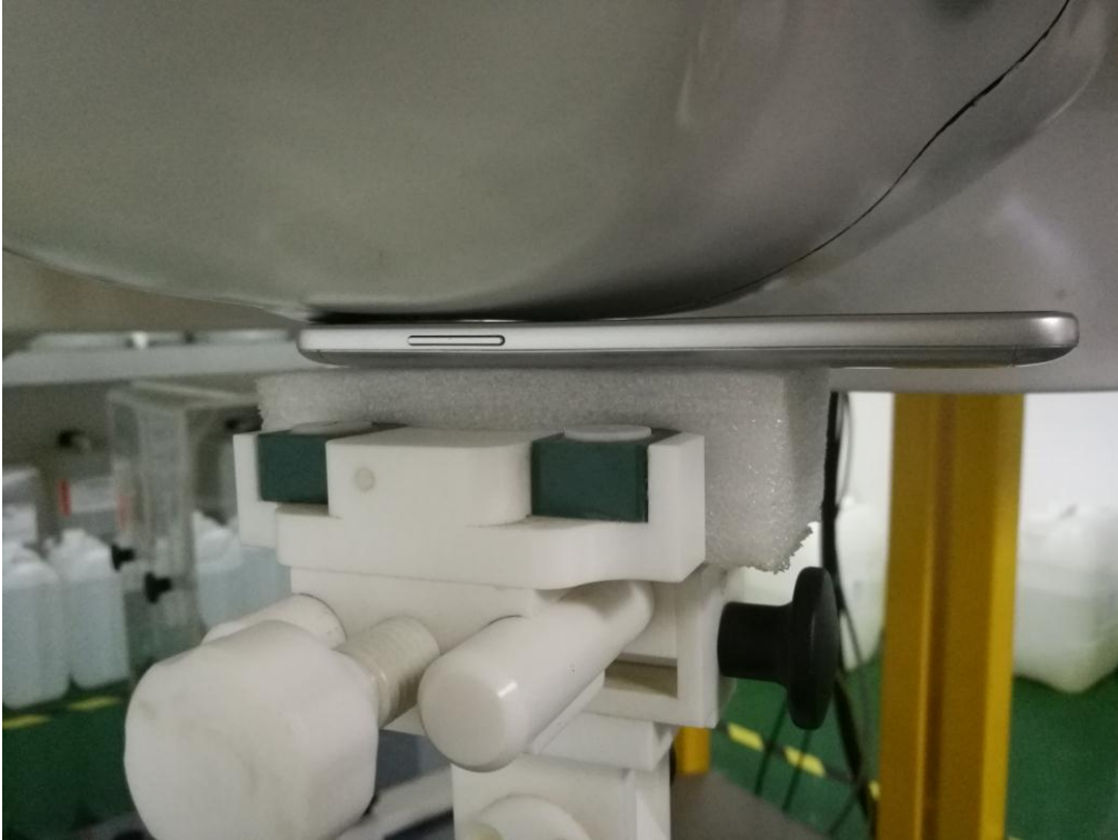
Right Head Tilt View