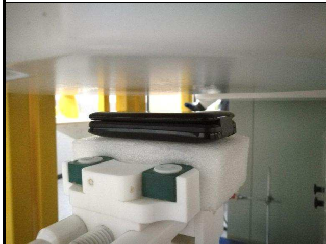
Front Face of EUT with 1.5 cm Gap