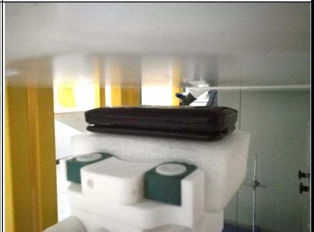
Rear Face of EUT with 1.5 cm Gap