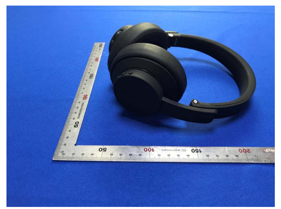
Model No.: New York