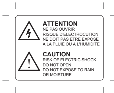
Label Size: 41W x 30mmH