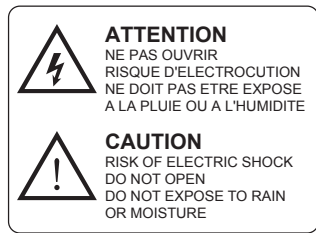
Label Size: 41W x 30mmH