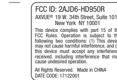
Label Size: 25W x 21mmH