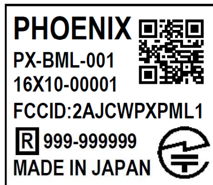
The label design