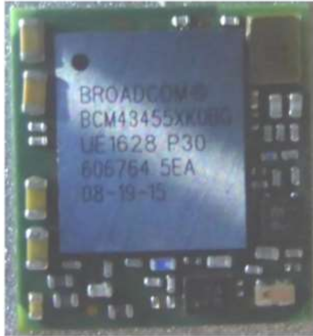
→ Module(Top --- Unshielded)