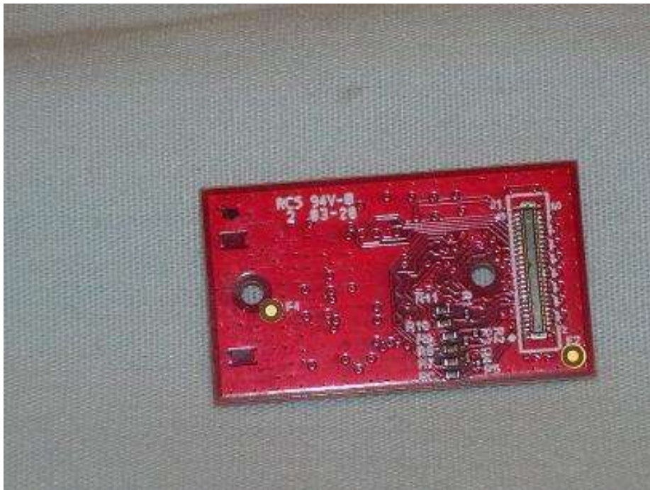
Photograph 2 – Back View of the Device