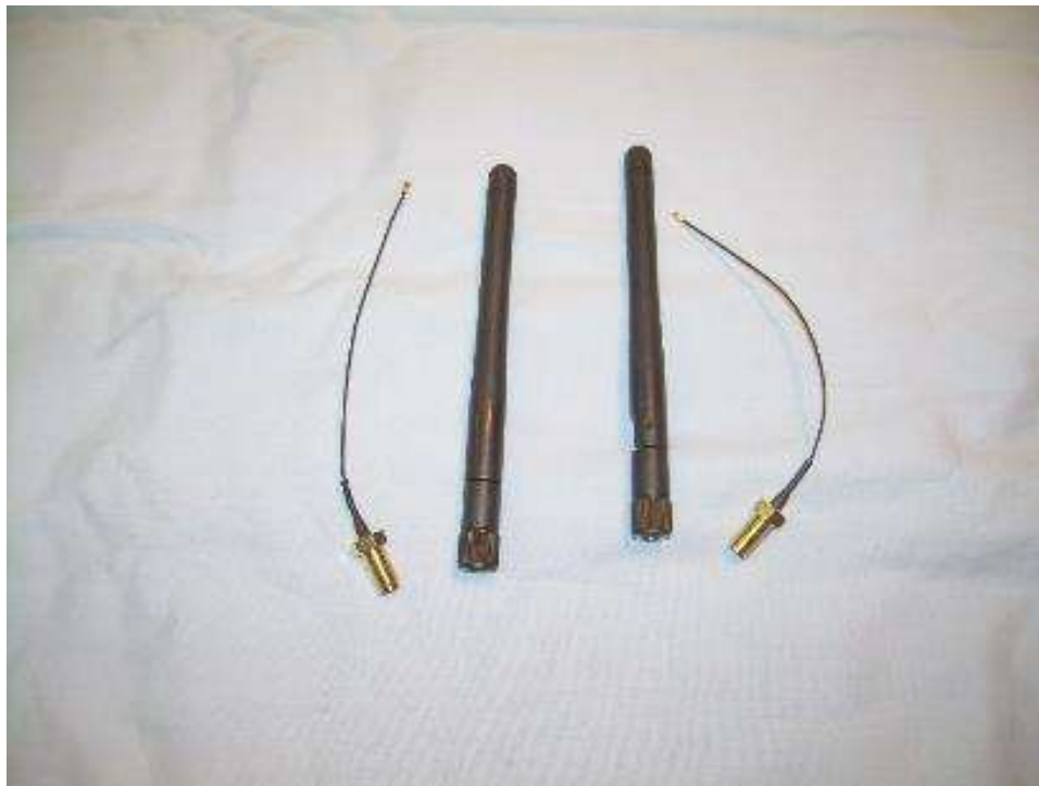
Photograph 4 – Antennas and Coax Cables