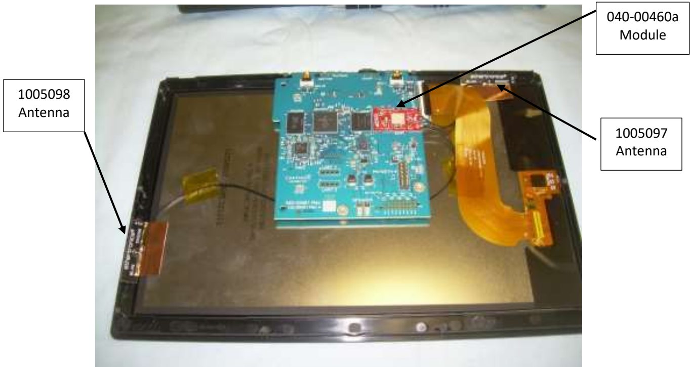
Photograph 6 – Antenna Set 3 Locations (C4-T4IW10)