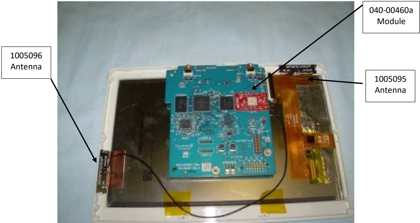
Photograph 7 – Antenna Set 4 Locations (C4-T4IW8)