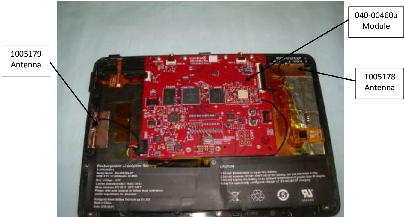
Photograph 5 – Antenna Set 2 Locations (C4-T4T8)