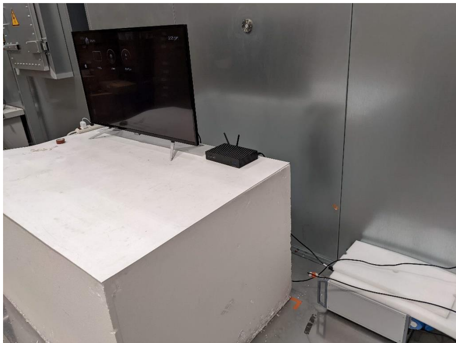
Photograph 5: Test Set Up AC Mains Conducted Emissions