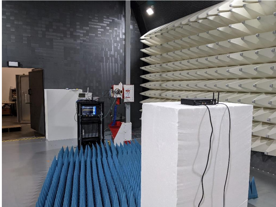
Photograph 3: Radiated Emissions 17 – 26 GHz