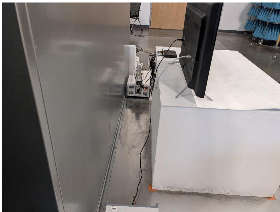
Photograph 6: Test Set Up AC Mains Conducted Emissions