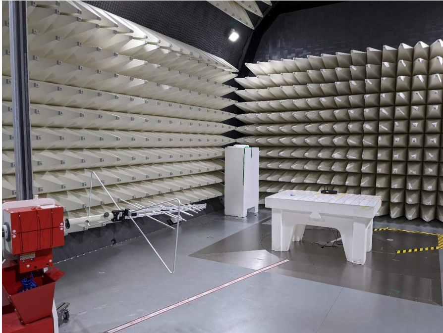
Photograph 1: Radiated Emissions 30 – 1000