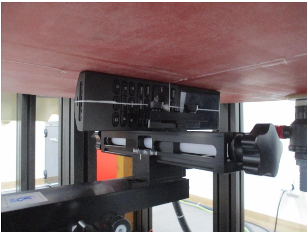
Left Side from Flat Phantom (Separation Distance: 0 cm)

This report shall not be reproduced except in full, without the written approval of KES Co., Ltd. The results shown in this test report refer only to the sample(s) tested unless otherwise stated. The authenticity of the test report, contact kes@kes.co.kr