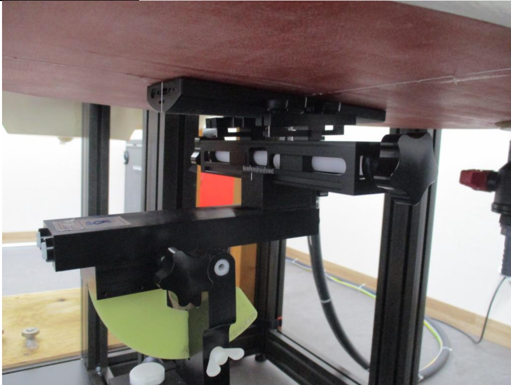
Front to mouth, Front Side from Flat Phantom (Separation Distance: 0 cm)