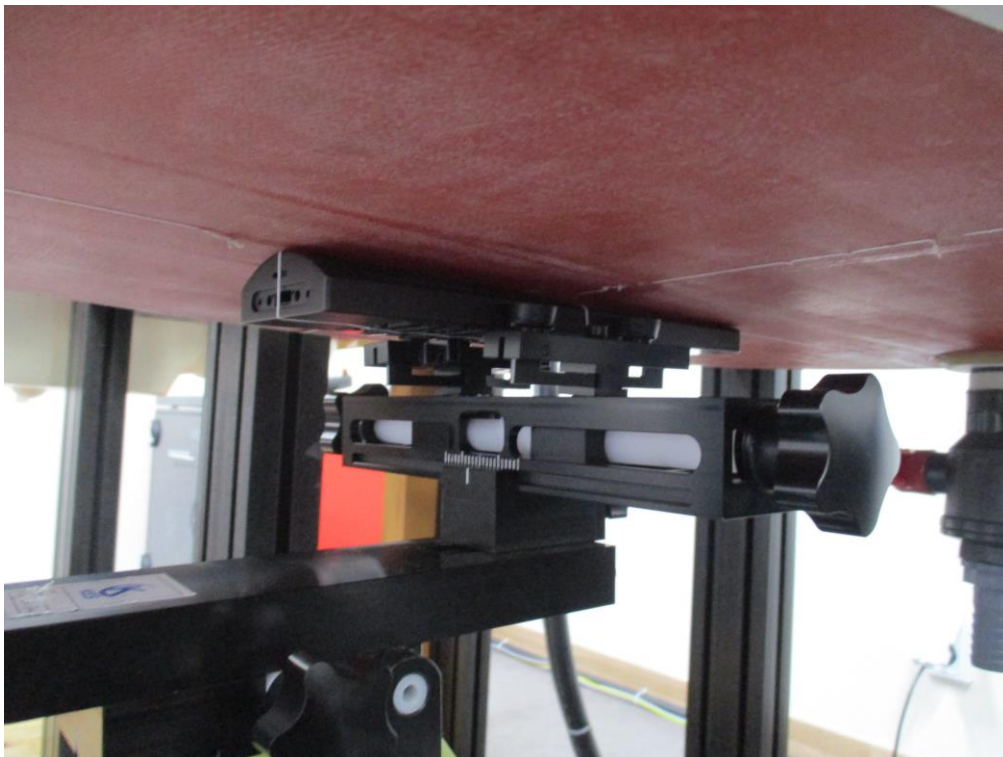
Rear Side from Flat Phantom (Separation Distance: 0 cm)

This report shall not be reproduced except in full, without the written approval of KES Co., Ltd. The results shown in this test report refer only to the sample(s) tested unless otherwise stated. The authenticity of the test report, contact kes@kes.co.kr