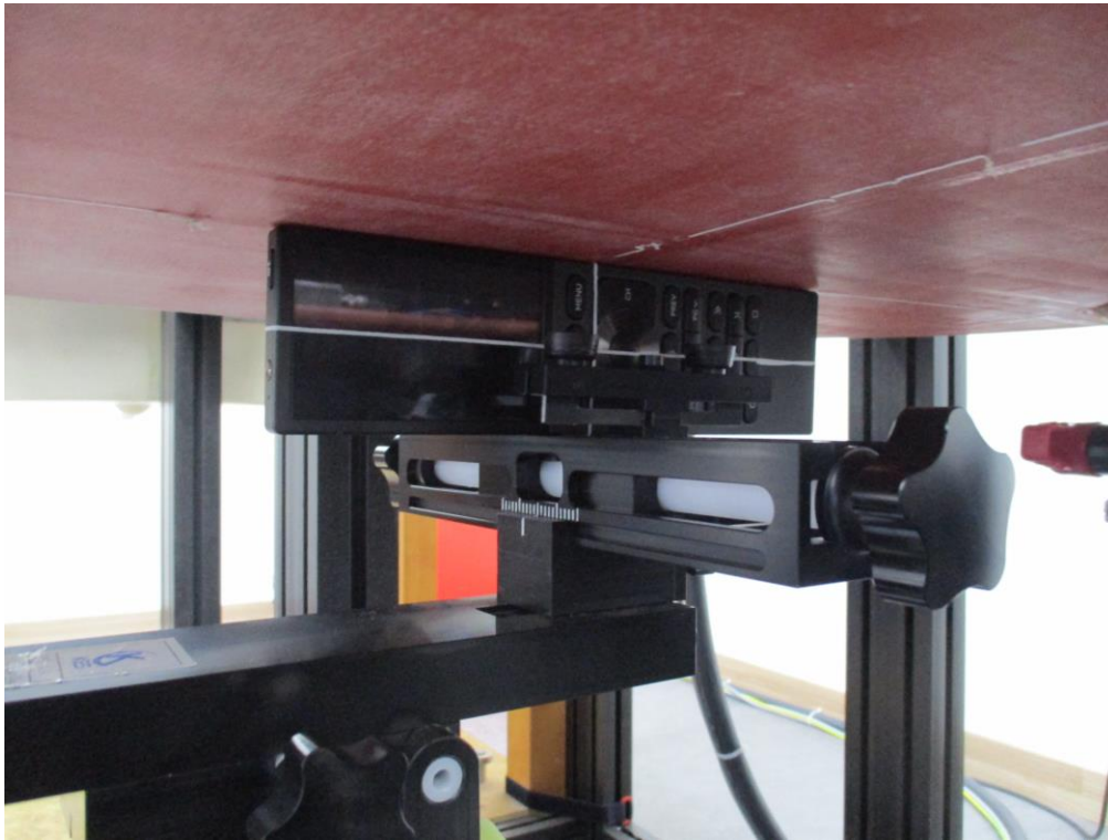
Right Side from Flat Phantom (Separation Distance: 0 cm)