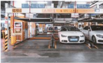
Parking lot Management