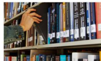
Library Book Management