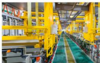
Product Line Management