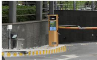
Automotive and Transportation