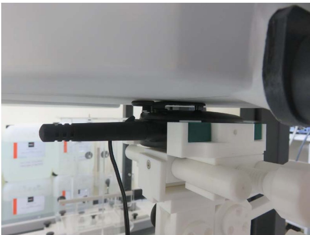
Figure 2 – Back surface 0mm Separation with earphone