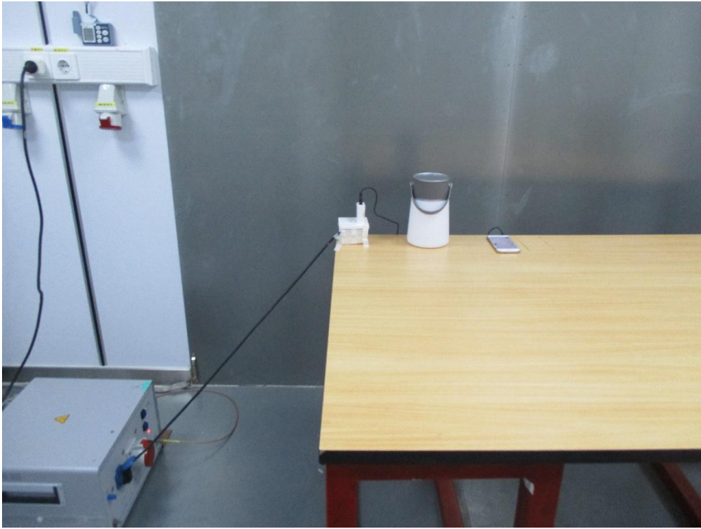
Conducted Emission Test