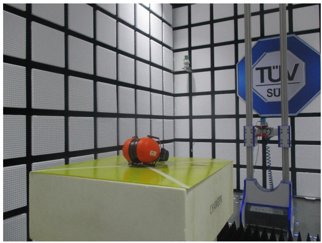
Radiated Emission Test above 1 GHz