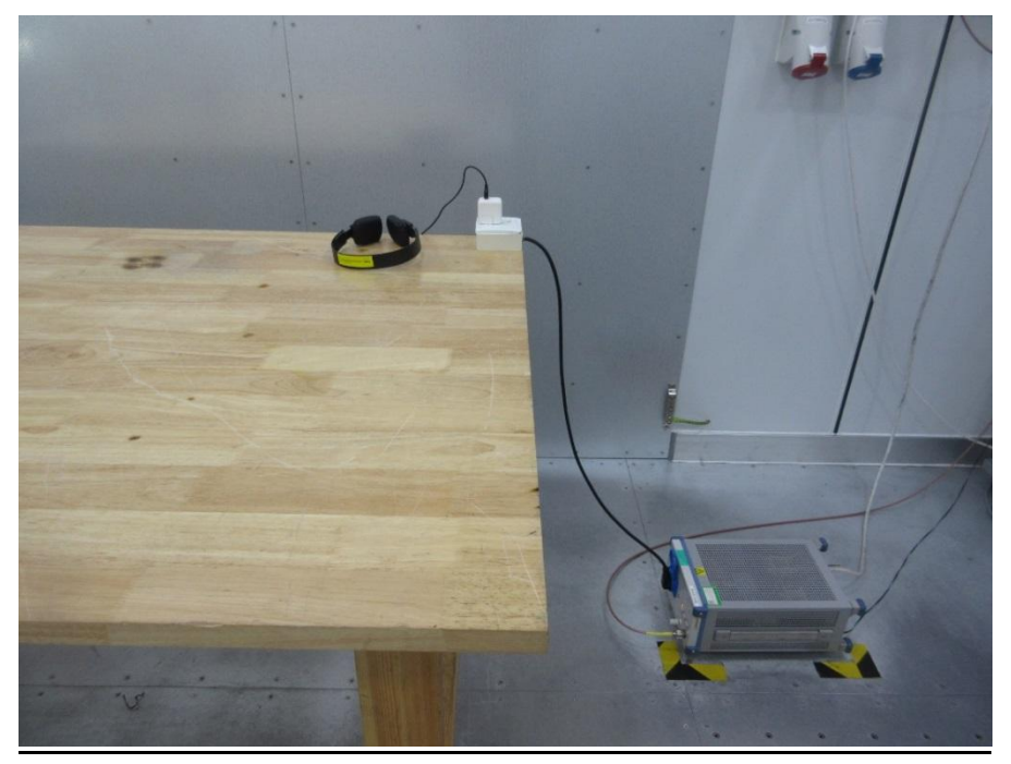
Page 1 of 1 TÜV SÜD Hong Kong Ltd. 3/F, West Wing, Phase 2, 10 Science Park West Avenue, Hong Kong Science Park, Shatin, Hong Kong