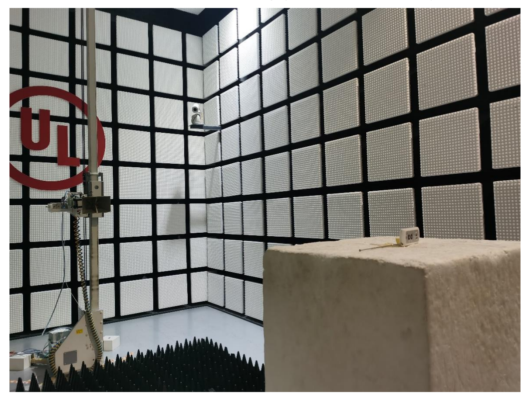
Radiated Disturbance Setup (Above 1 GHz – Y axis)

Radiated Disturbance Setup (Above 1 GHz – X axis)