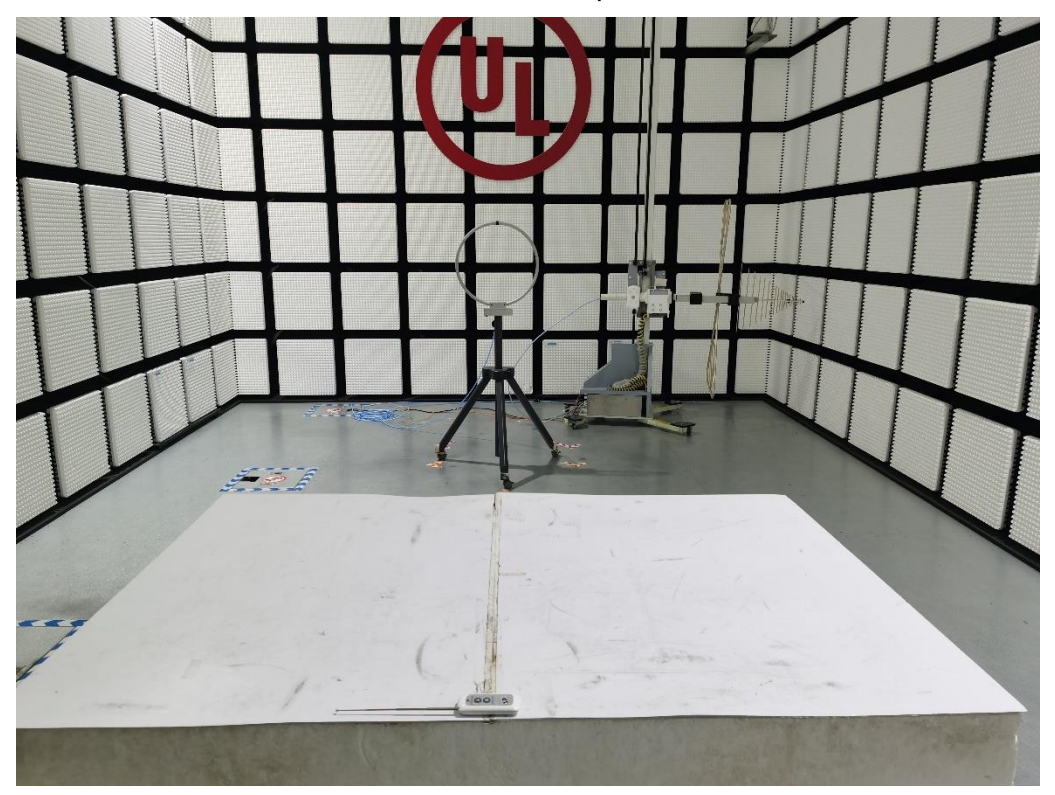
Radiated Disturbance Setup Below 30 MHz

Radiated Disturbance Setup Below 1 GHz and Above 30 MHz