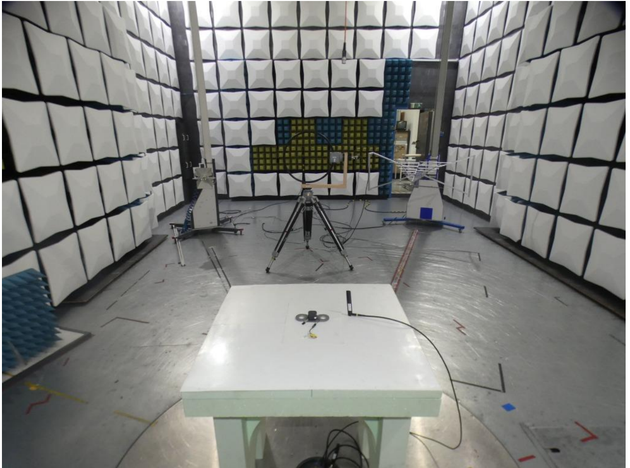
Photo 1: Test setup for radiated measurements (stand alone setup, 9 kHz - 30 MHz; FCC 15c247)