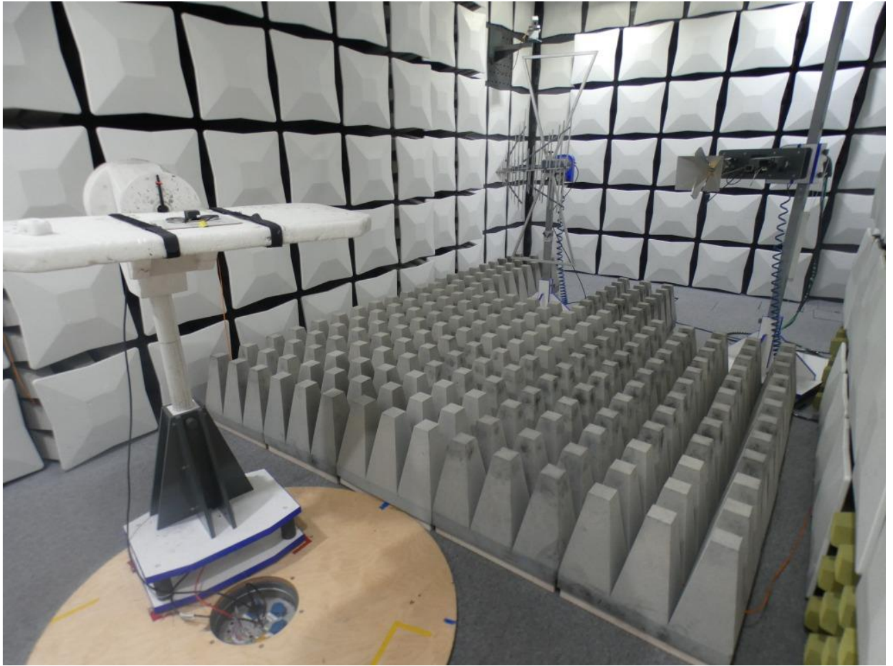
Photo 4: Test setup for radiated measurements (stand alone setup, 1 GHz – 24 GHz; FCC 15c247)