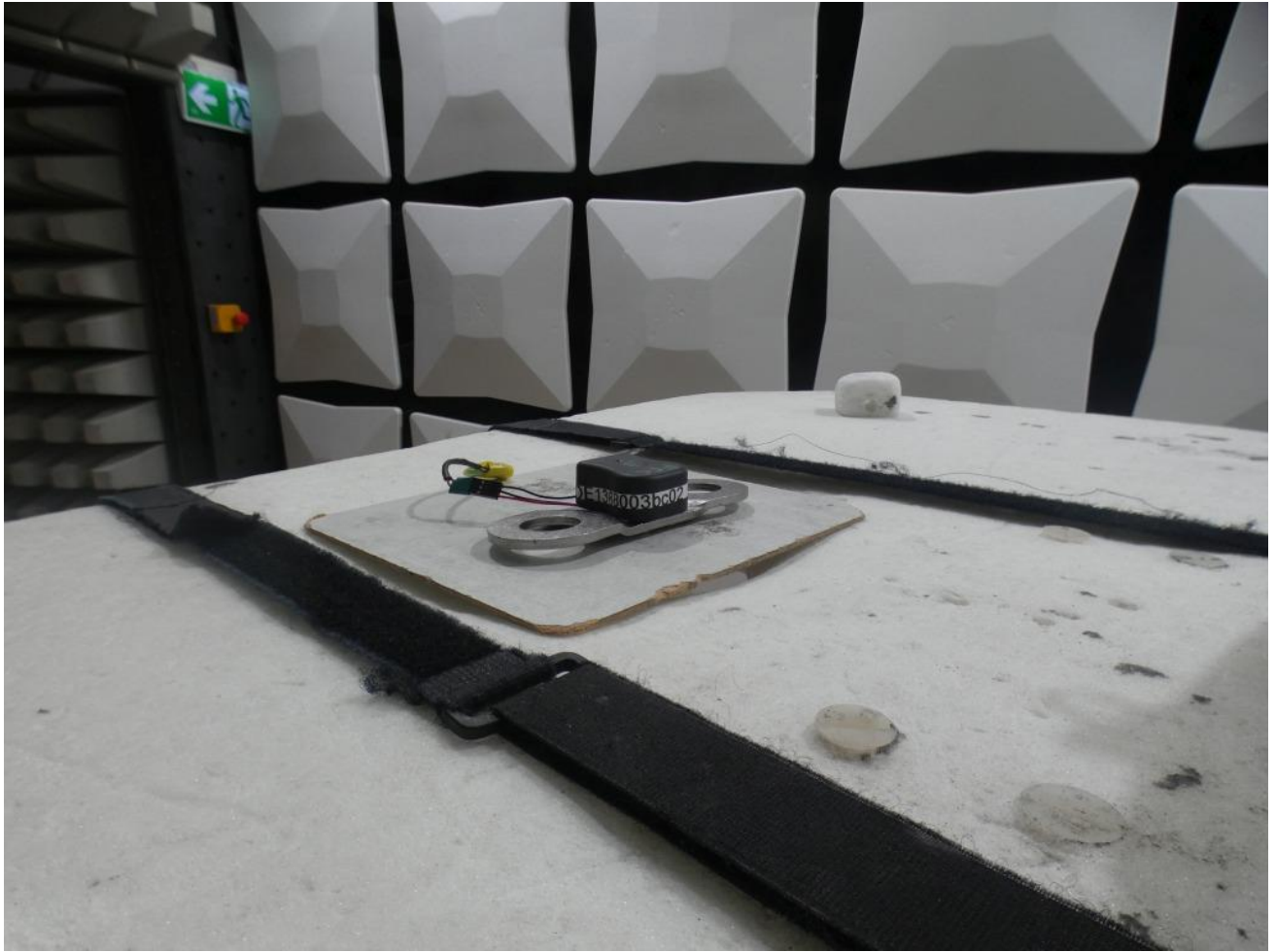
Photo 5: Test setup for radiated measurements, detailed view (stand alone setup, 1 GHz – 24 GHz; FCC 15c247)