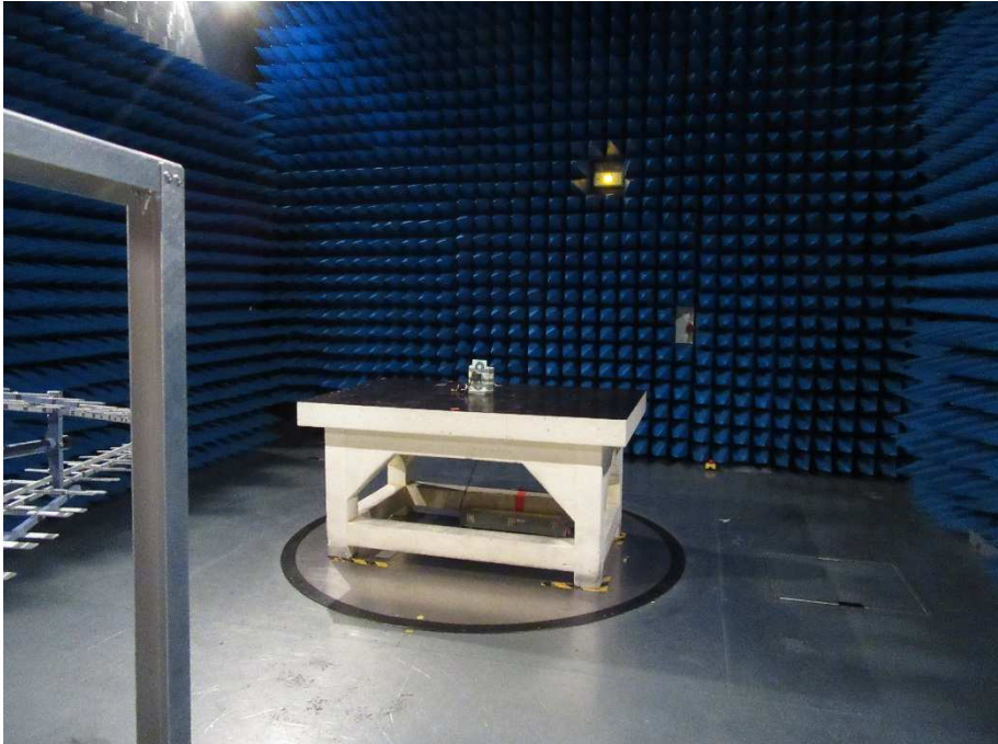
TPMS EWM / front side of EUT