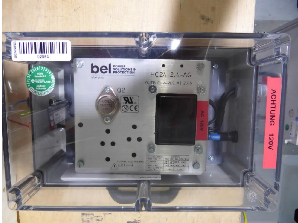
Power adapter bel HC24-2.4