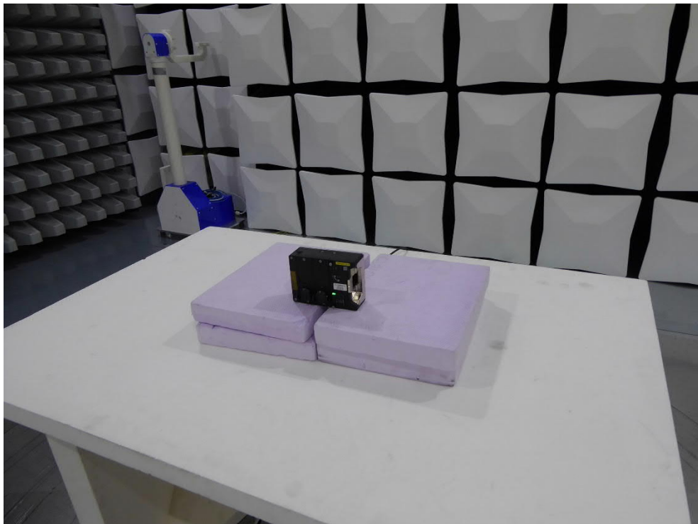
Test setup semi anechoic chamber