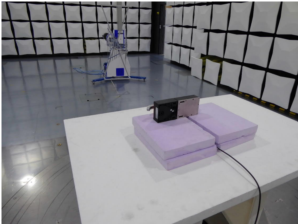
Test setup semi anechoic chamber (30 MHz to 1 GHz)