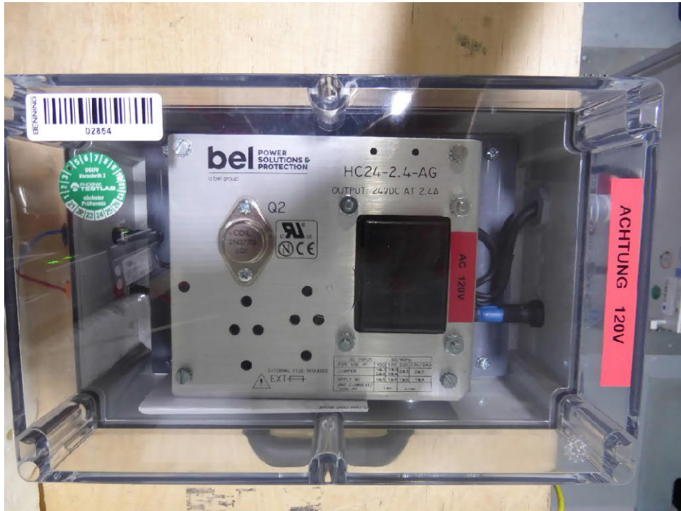
Power adapter bel HC24-2.4