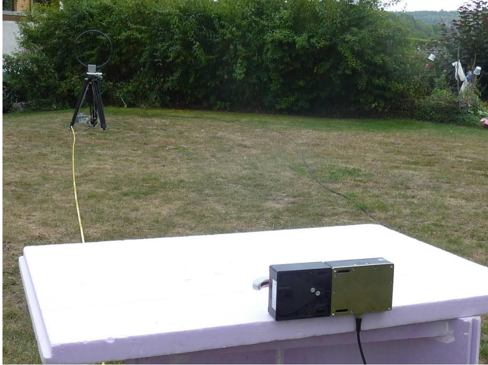
Test setup Outdoor test side (9 kHz to 30 MHz)