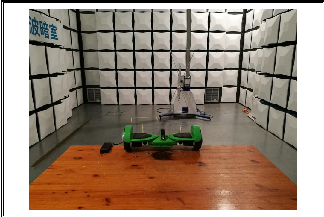
RADIATED RF MEASUREMENT SETUP (ABOVE 1 GHz)