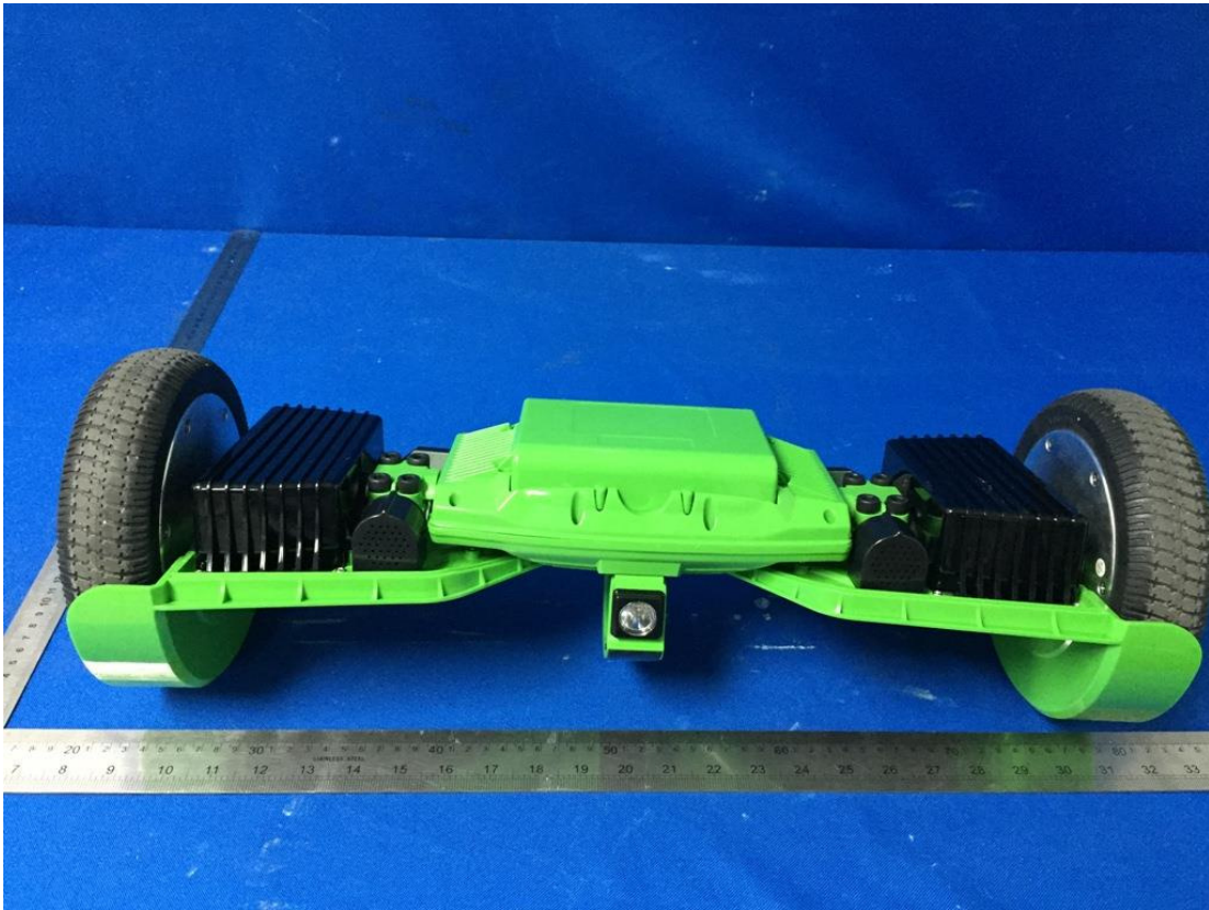
Left View of EUT