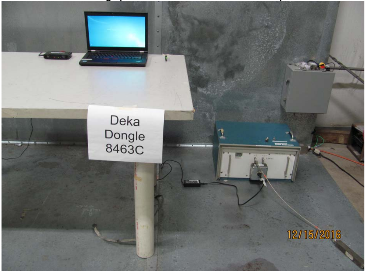
Photograph of Conducted Emissions Test Setup