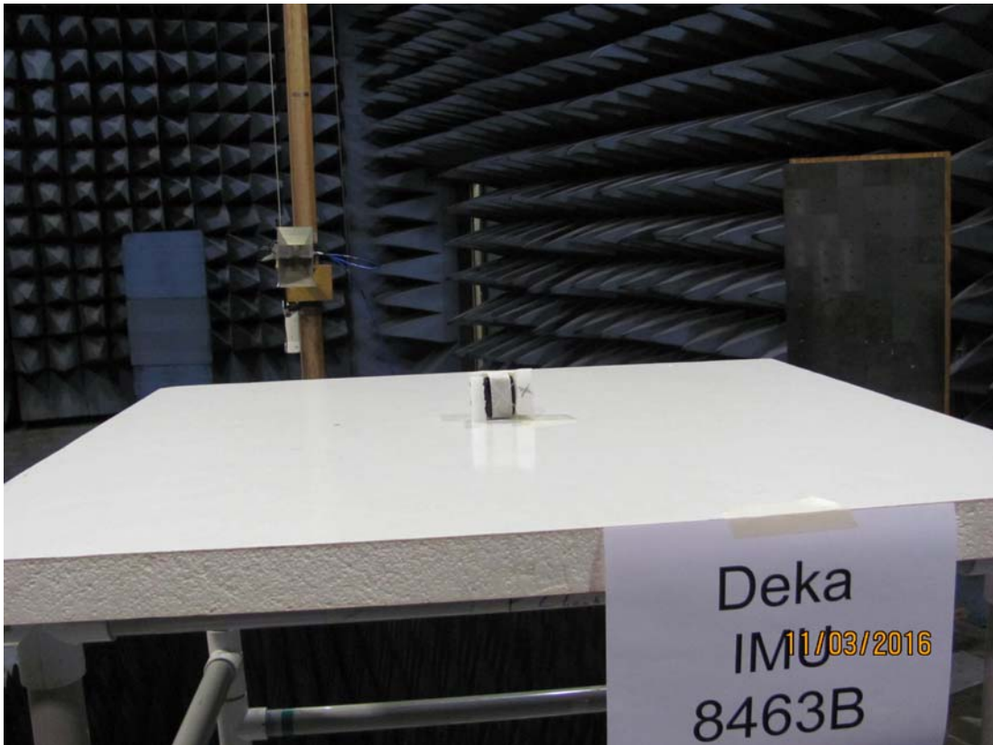
The EUT was taped to a foam stand in order to change the axis of rotation.