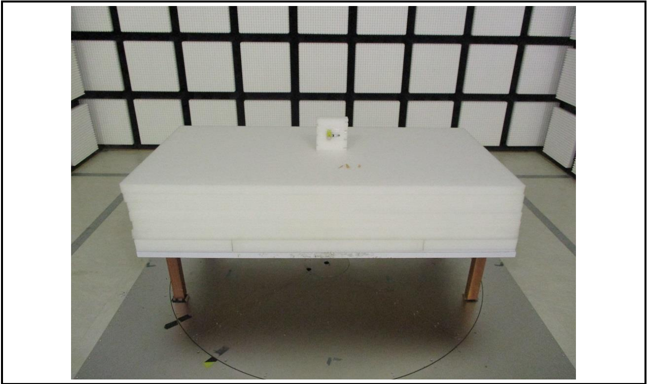
Radiated Emission Below 1GHz Test