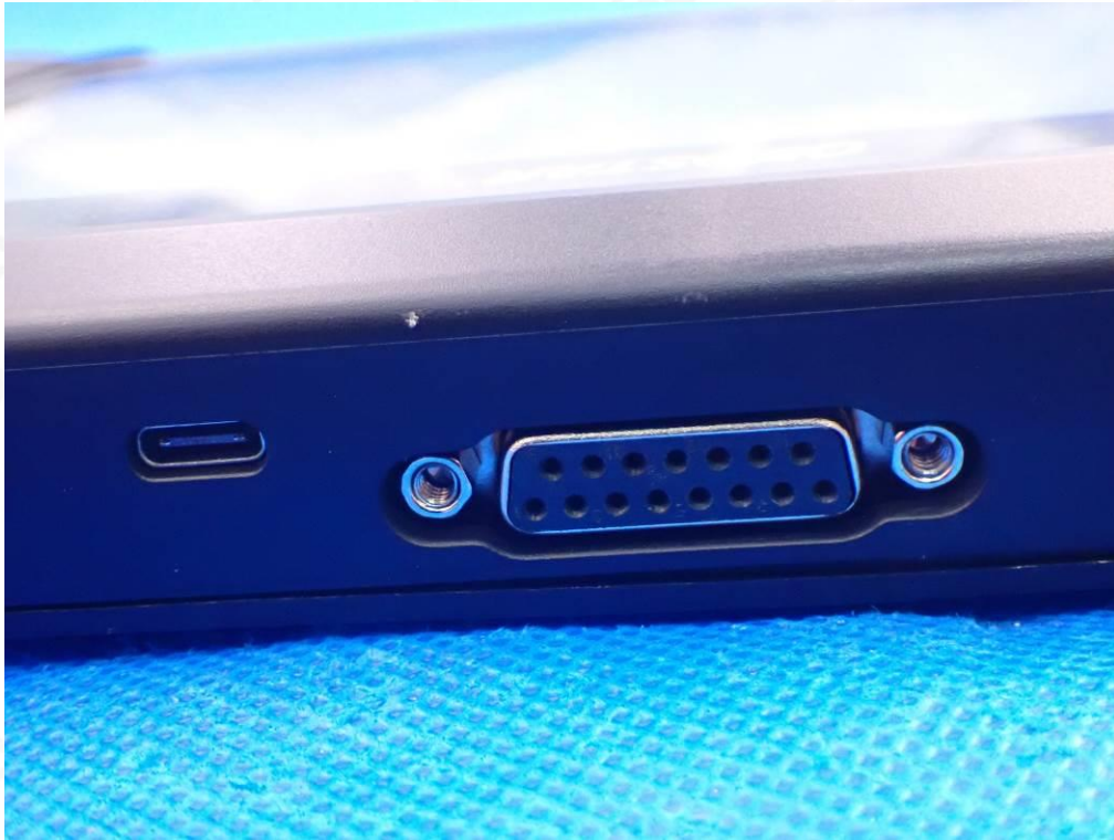
PORT VIEW -2 OF EUT