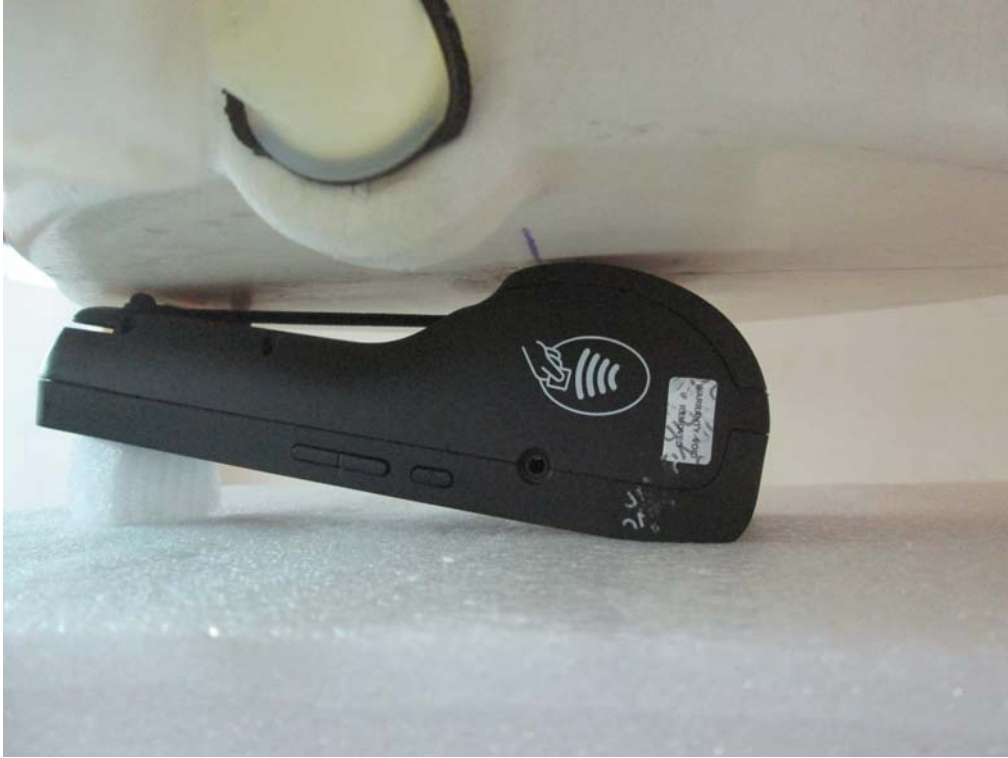
Handheld Right Setup Photo (0mm)