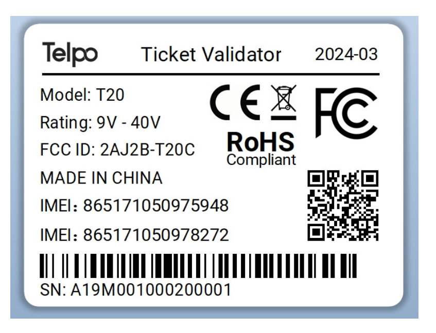
FCC ID Label Location Information