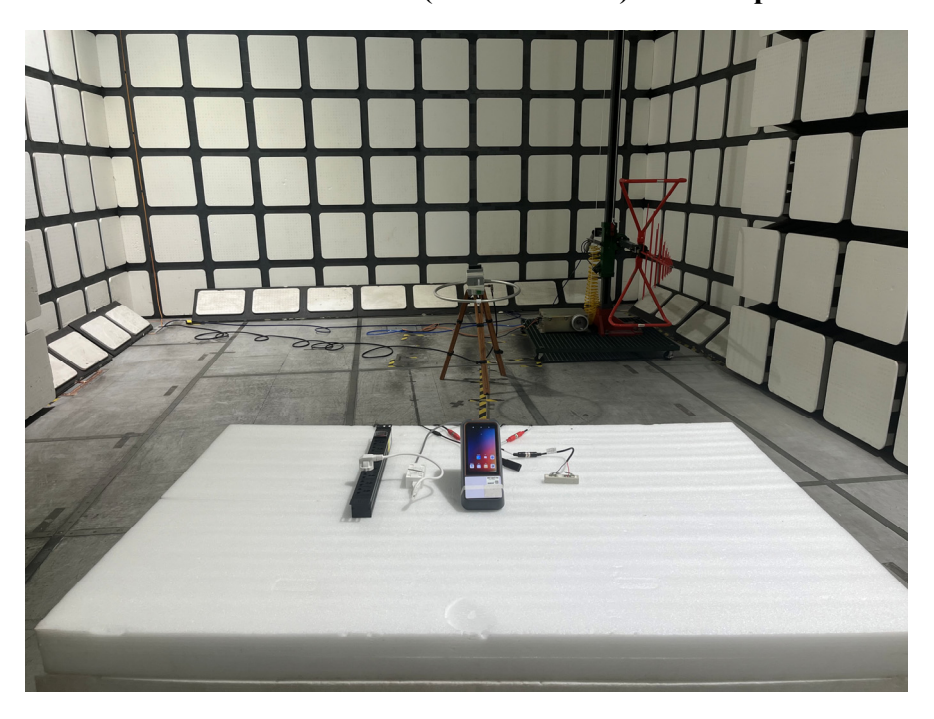
Radiated Emissions View (Below 1 GHz)