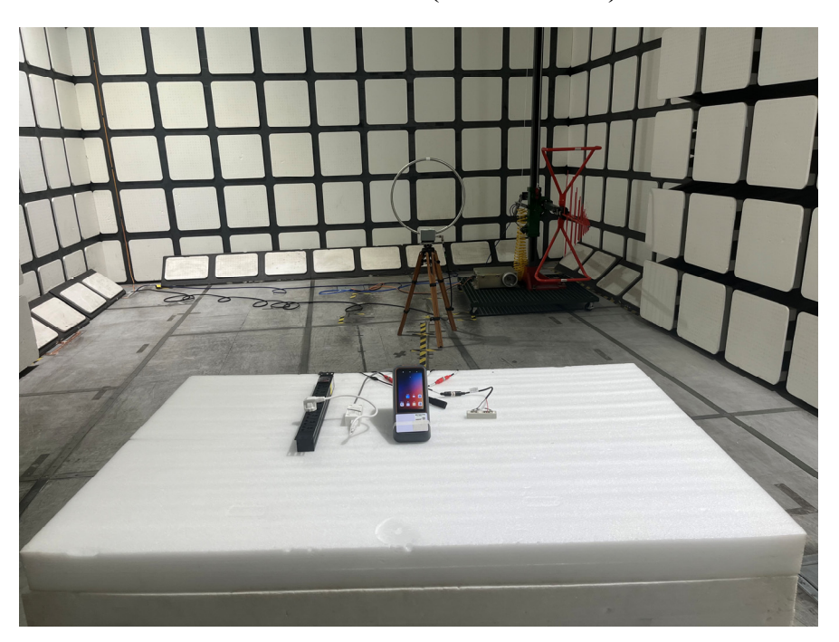
Radiated Emissions View (Below 30MHz) Perpendicular