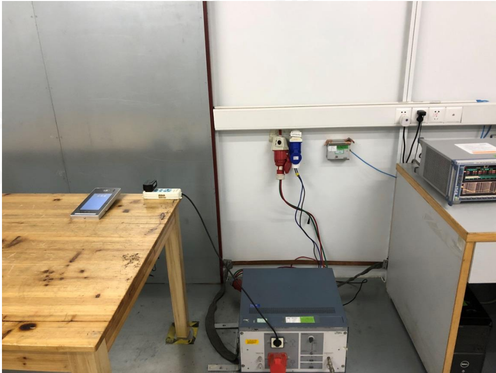
CONDUCTED TEST SETUP