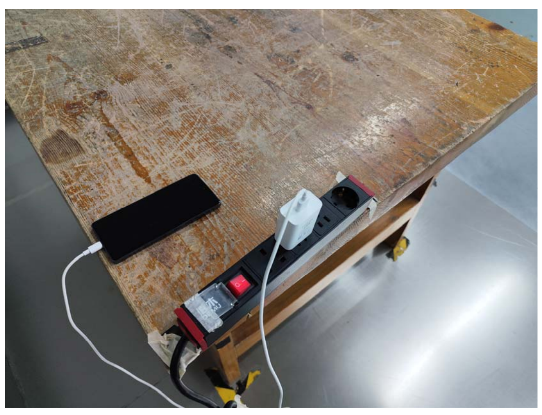
Conducted Emissions Side View