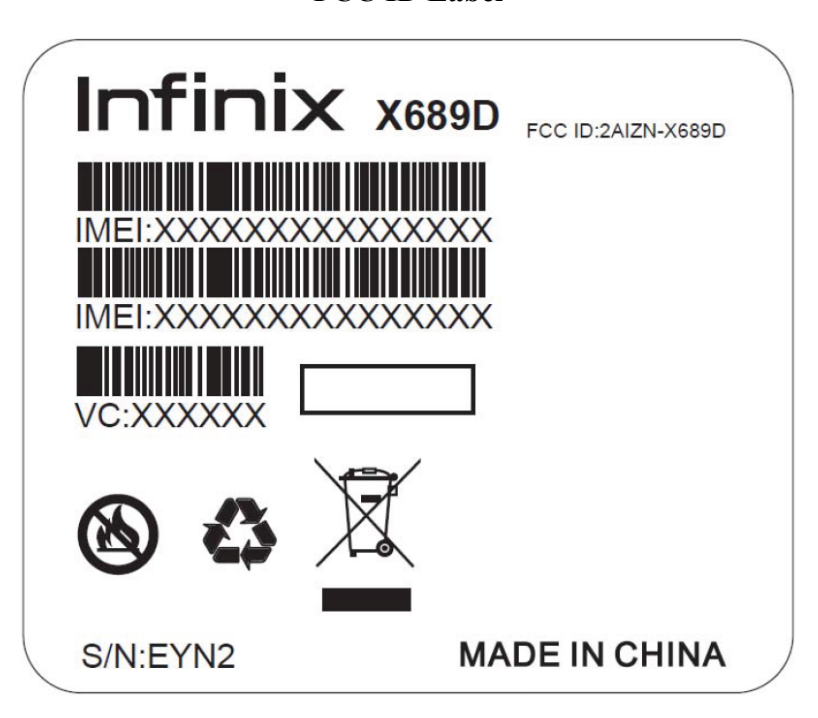
FCC ID Label Location Information