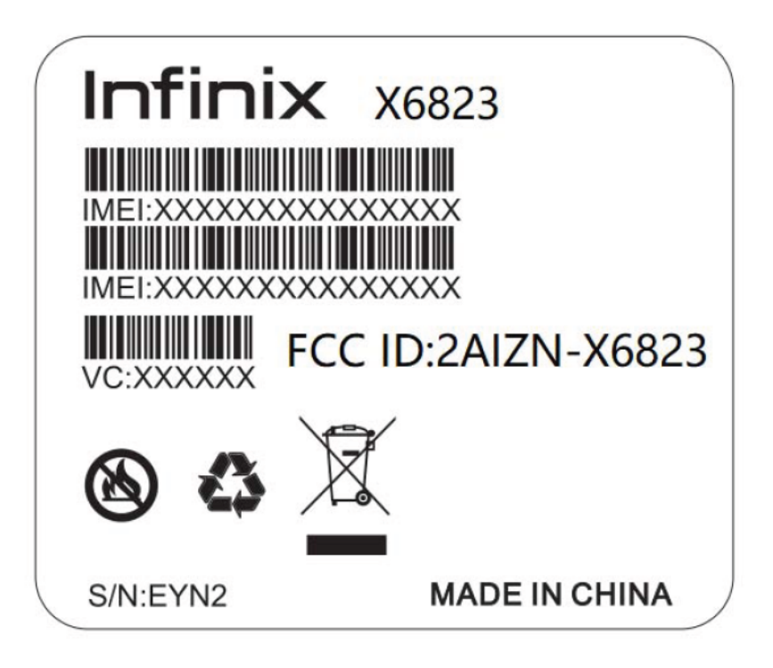
FCC ID Label Location on Back Side