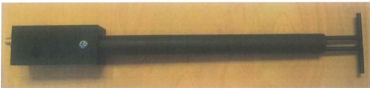
Figure 1 – MVG COMOSAR Validation Dipole

MVG's COMOSAR Validation Dipoles are built in accordance to the IEC/IEEE 62209-1528 and FCC KDB865664 D01 standards. The product is designed for use with the COMOSAR test bench only.