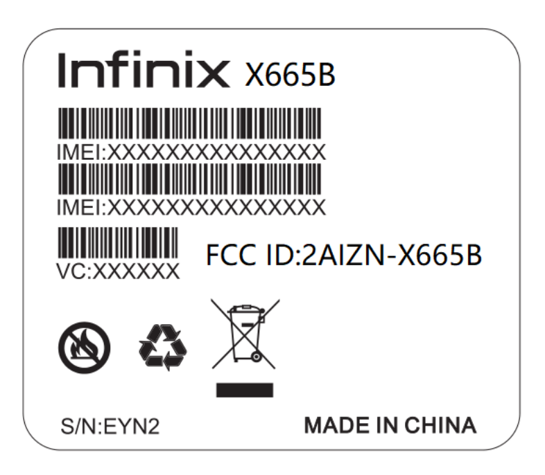
FCC ID Label Location Information