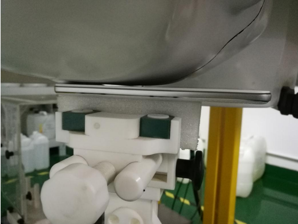
Right Head Tilt View