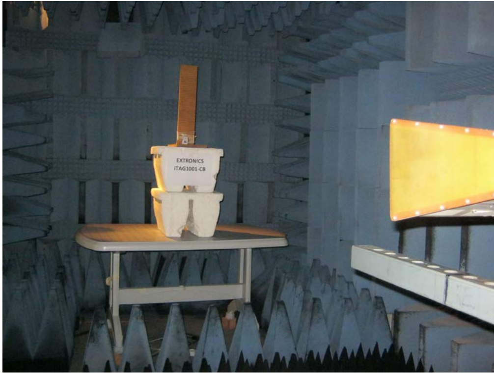
Figure 3. Radiated Emission Test