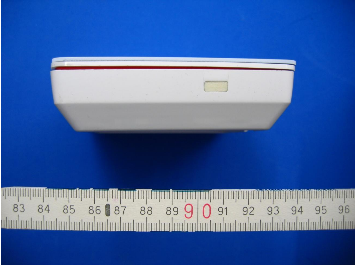
Photograph 5: Vitoconnect OT2 – Left Side