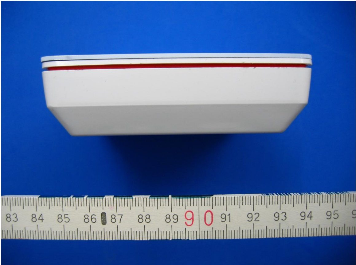
Photograph 6: Vitoconnect OT2 – Right Side