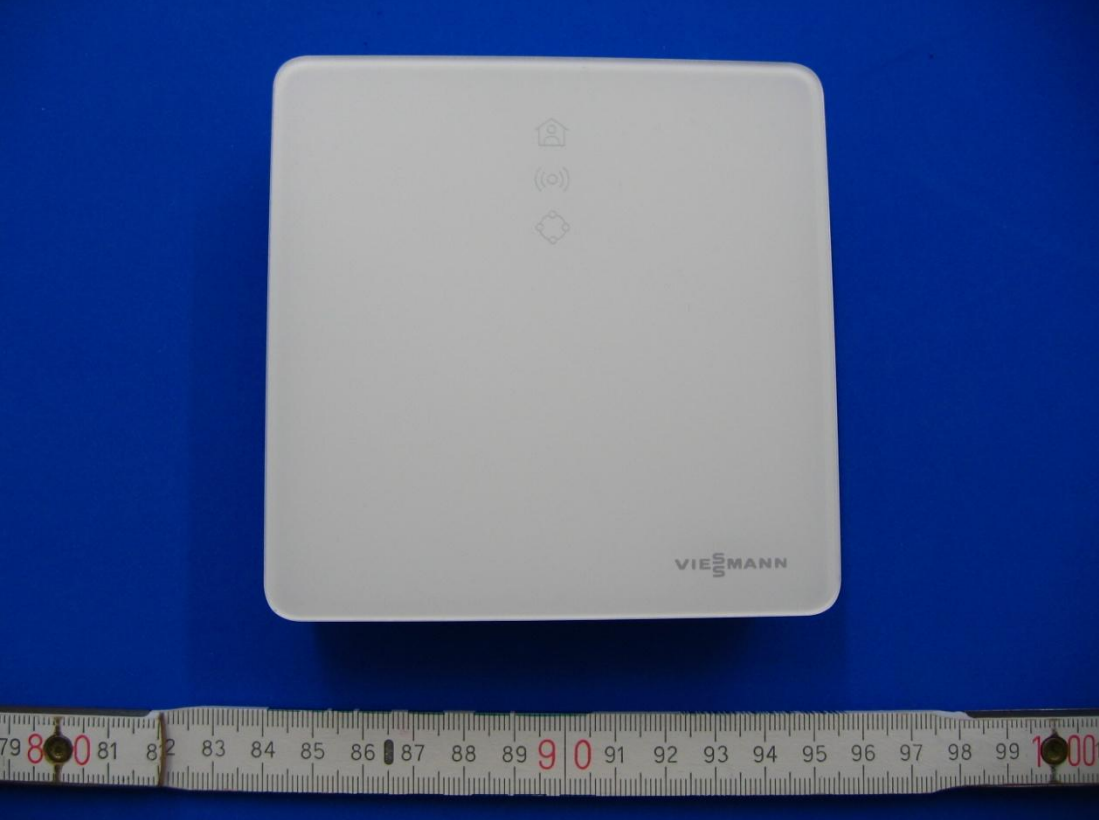
Photograph 1: Vitoconnect OT2 – Top Side