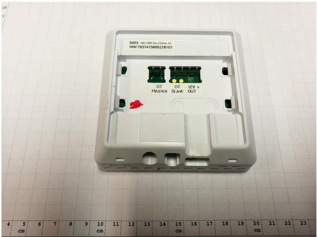
Photograph 3: Vitoconnect OT2 – Bottom Side