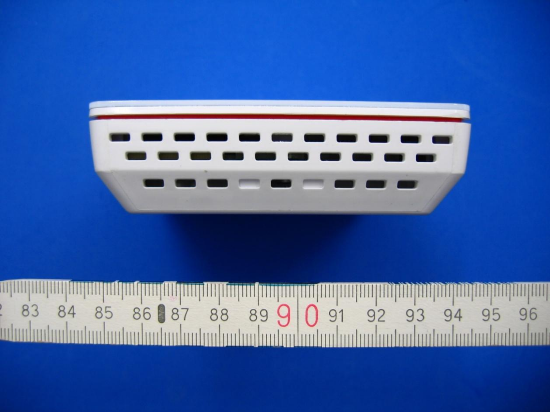
Photograph 2: Vitoconnect OT2 –Rear Side