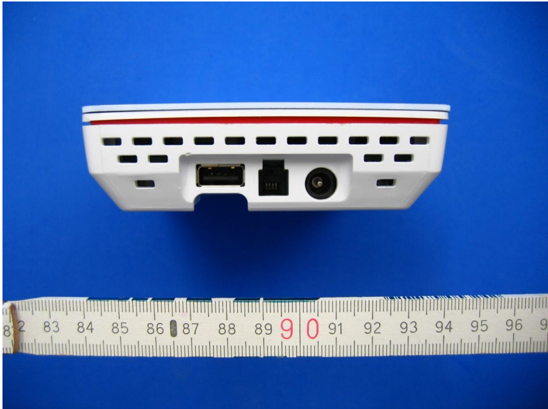
Photograph 4: Vitoconnect OT2 – Connector Side (Front Side)