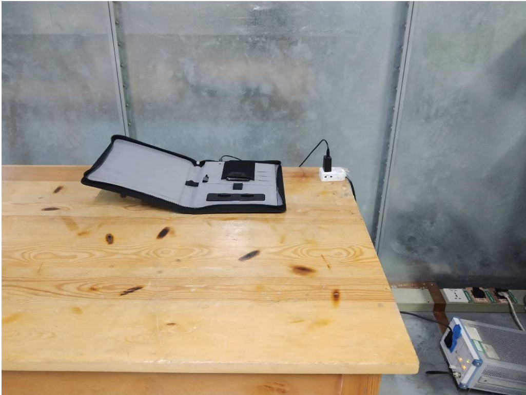
Conducted Emission-AC adapter charge mode