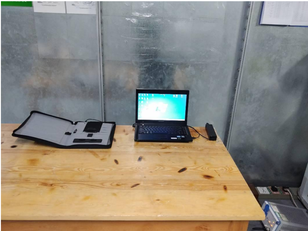
Conducted Emission-PC charge mode