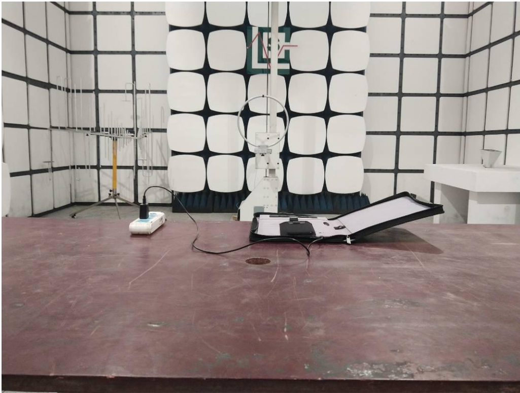
Radiated Emission below 30MHz-AC adapter charge mode