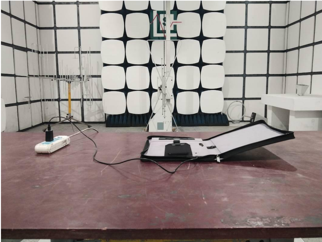
Radiated Emission below 1GHz-AC adapter charge mode